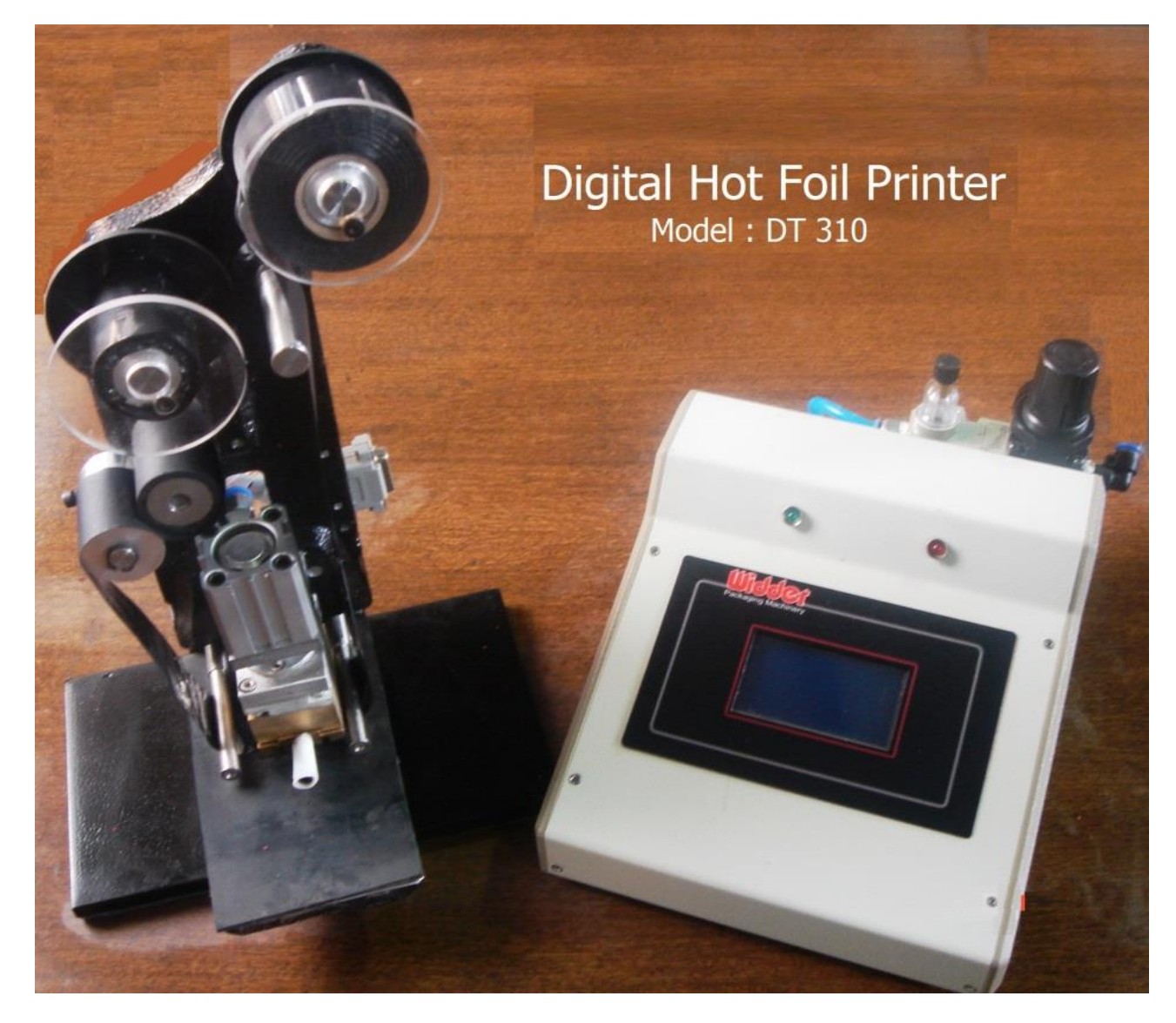
Table top Digital Hot Foil Printer

The controlling system has dual and delay functions and also could control adjusted heating degree of printing head. There is printed messages counter and heat of print head digits showing on LCD monitor of controller.