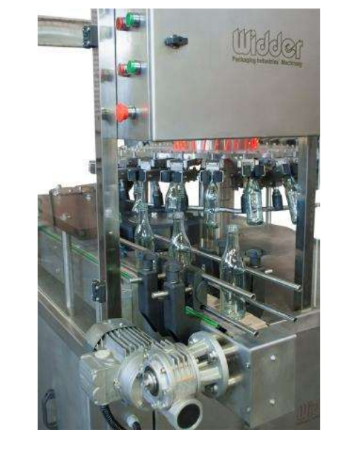
Output conveyor & control cabinet