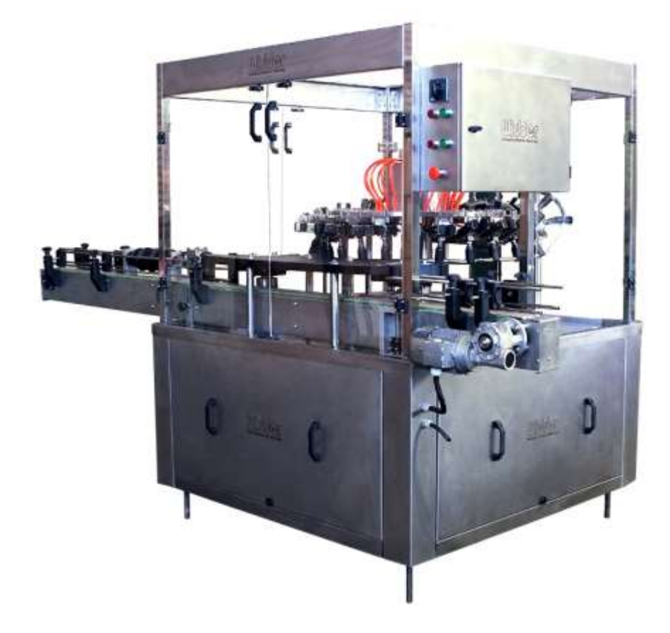
Rinsing unit neck holding bottle grippers & output Star