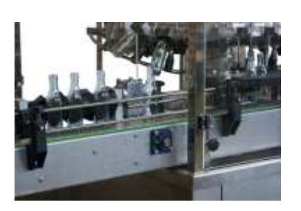
Irregular screw Timing unit