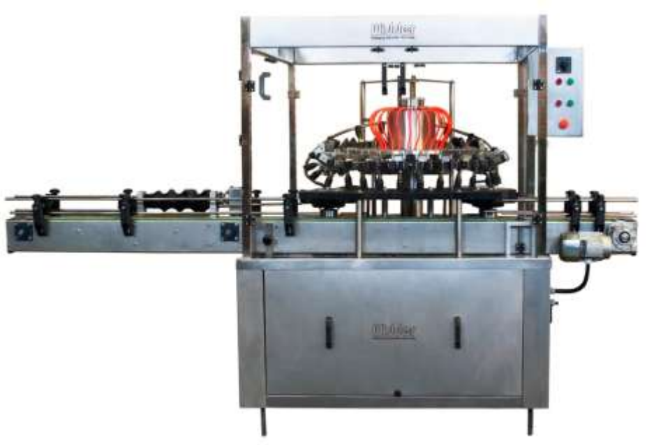
Rotary Rinsing machine