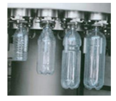
Possibility of different bottle size change over