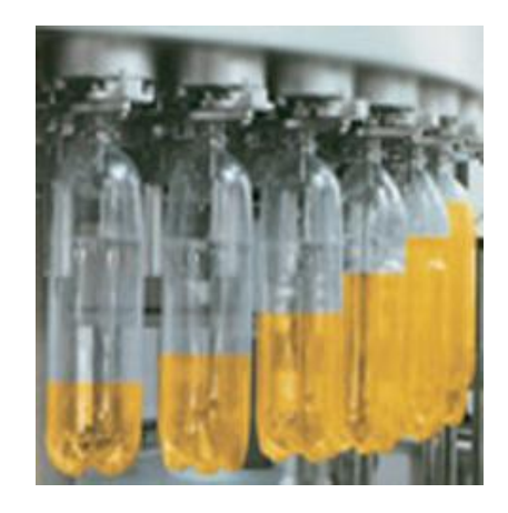
Automatic filling valves work smoothly but fast