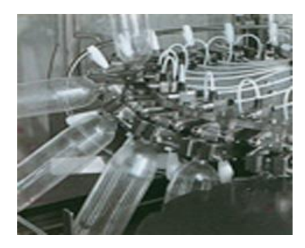
Rinsing unit neck holding bottle grippers