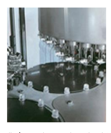
Filler's stainless steel ring bowl & Bottle movement neck handling system with star discs and external guides